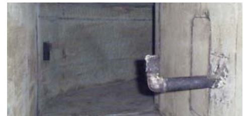
After: Dust and contaminants completely removed