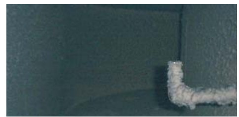
Before: Ductwork coated with thick dust and grime